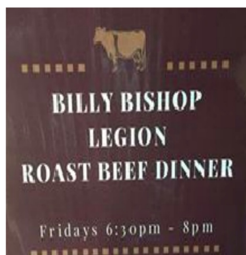
Friday Night Roast Beef Dinners